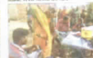
महिलाओं के साथ होने वाले यौन हिंसा पर कार्यशाला